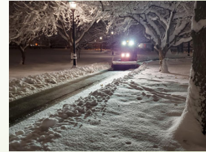
Office of Facilities Management – Grounds Department